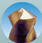
Twist drill bits