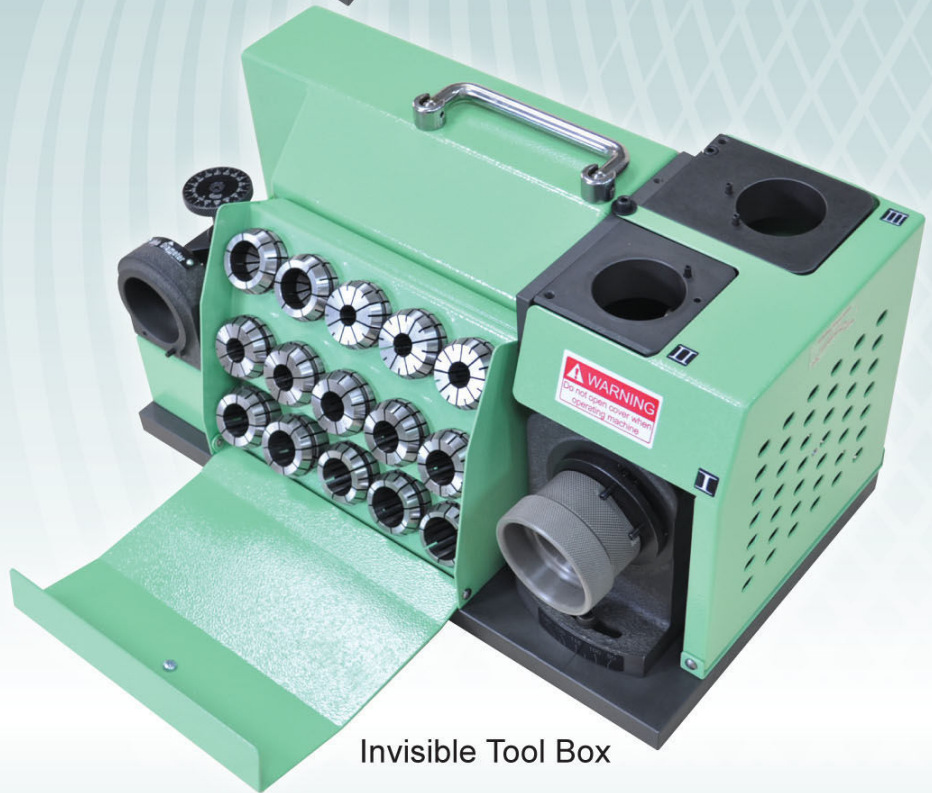
Invisible Tool Box