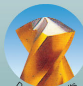
Deep-slot drill bits